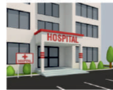
Land for hospital