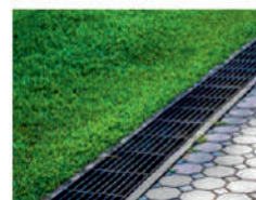
Modern sewer and drainage system