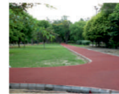
Green park with jogging track