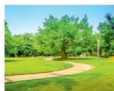
Kids play area & green belt