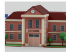
Land for school